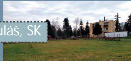
Liptovský Mikuláš, SK

A GREEN STREET - BANKOWA STREET There must be more grass which fills the gaps between concrete slabs in grassy pavement. It would also be reasonable to include an absorbent basin, which slows down the water flow, enables infiltration into groundwater and acts as a rainwater pollution filter, perfectly working along roads, squares and parking. Water can be supplied through the street inlet system or directly from the sidewalks.